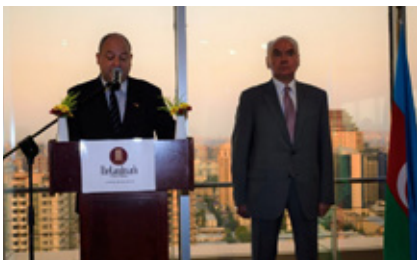
P. 4 CELEBRATING BELGIUM NATIONAL DAY