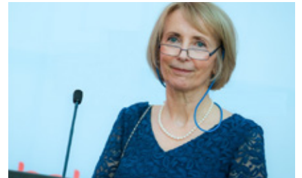
P. 13 INTERVIEW WITH BRITISH AMBASSADOR